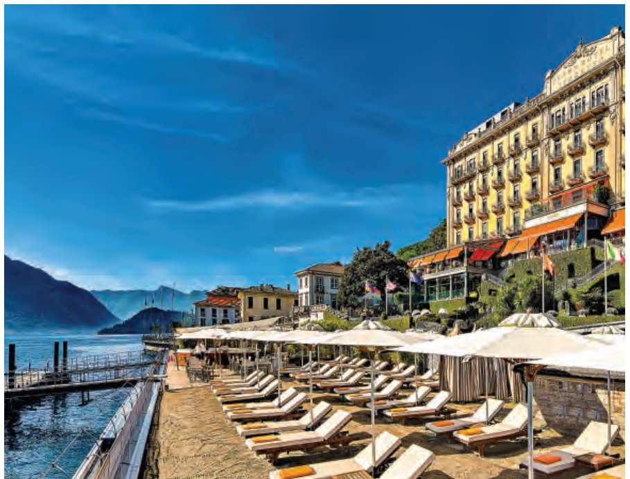
Grand Hotel Tremezzo