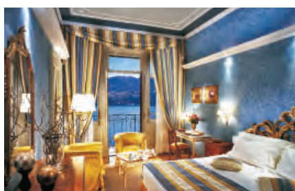
Lake view superior room at Tremezzo