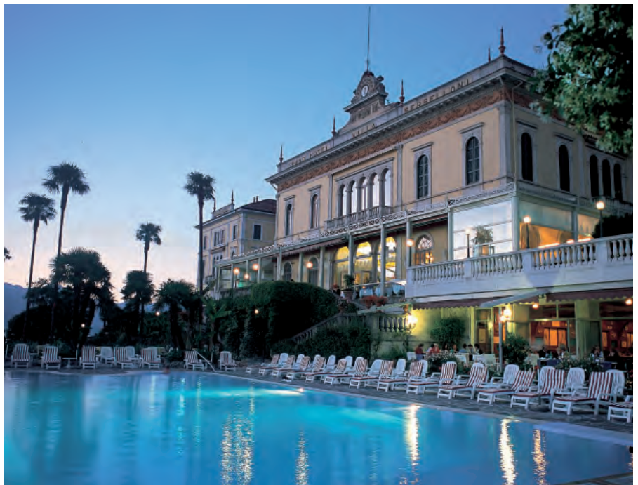
Grand Hotel Villa Serbelloni, Bellagio

The Villa Serbelloni is one of the oldest and most elegant hotels on Lake Como and offers incredible panoramic views of the lake from its privileged position in Bellagio. In its lush gardens Mediterranean and subtropical plants flourish in the pleasant microclimate around the lake. There are 95 rooms and suites furnished in a traditional style, all of which are fitted with air conditioning and free wifi. The hotel boasts two good quality restaurants, the Mistral and La Goletta, or guests can choose to eat locally in Bellagio.