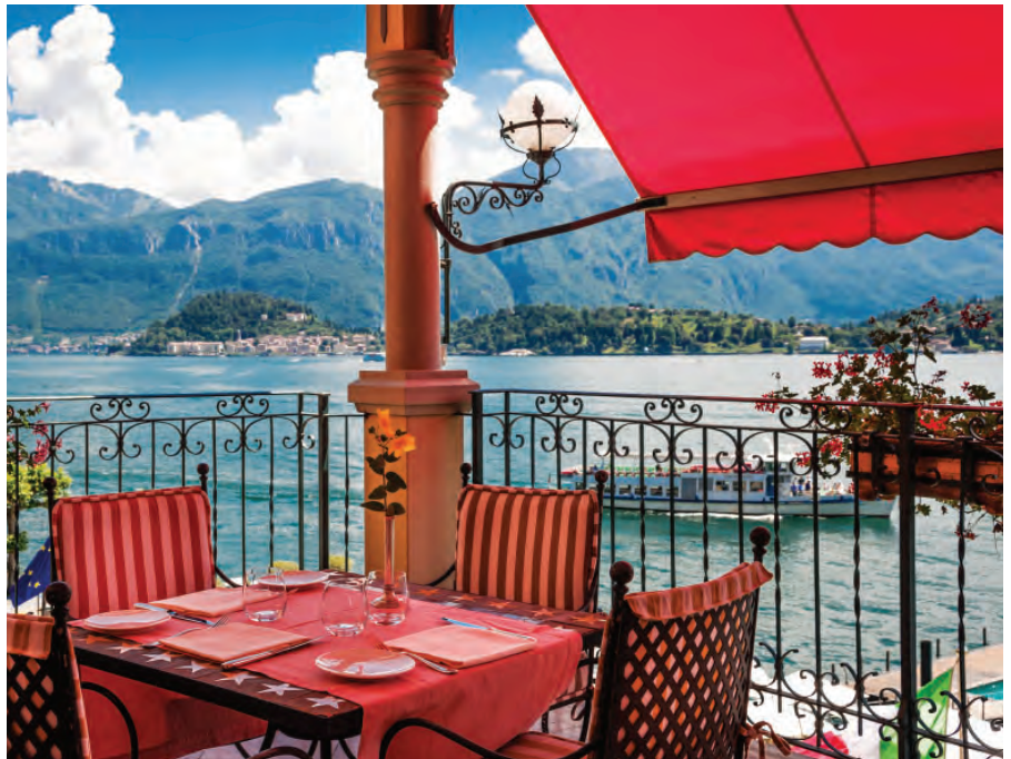
Lake Como from Grand Hotel Tremezzo

After checking out of your hotel, a car will take you back to Milan station where you catch an overnight sleeper train to Paris, departing at about 11pm.