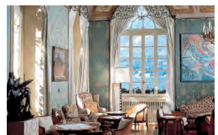
Lounge at Villa Serbelloni